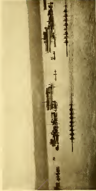
BOAT RACE ON CAYUGA LAKE